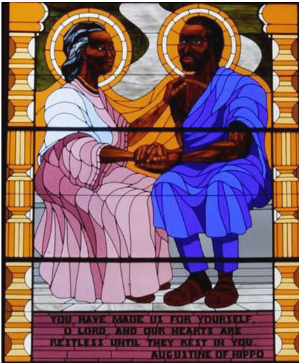
St Augustine and his mother, St Monica, are depicted in a stained-glass window at St Augustine Church in Washington.

We pay tribute to all mothers in the month of May. Mothers brought us into the world, cared and nurtured us in our first years, and journeyed with us through early childhood until whatever age we are today. Mothers deserve our greatest and most grateful and loving thanks. God bless them all. We pray for mothers who are deceased and those who are separated from us for whatever reason.