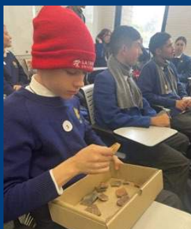
Fossils in Archaeology